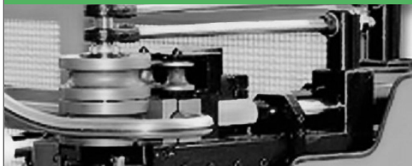
PROVAR 5 U-D