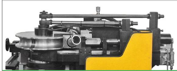
PROFAST CN3 st